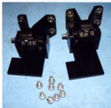
DeStroked Motor Mounts

We'll be looking for more good examples of repowered rigs in upcoming issues. Chances are, we've only scratched the surface. So if you can share a good source of practical info or parts, feel free to send me an e-mail at john.stewart@apg-media.com