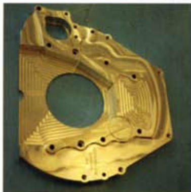
Cummins to Ford 4R100 (DeStroked)